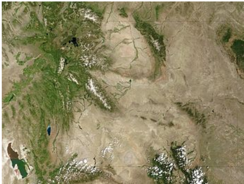
Satellite image of part of the Wyoming Basin, USA.

The May 2014 issue of Scientific American includes an article on remote sensing that follows what to many might seem an odd direction: how to increase the chance of finding rich fossil deposits (Anemone, R.L. & Emerson, C.W. 2014. Fossil GPS . Scientific American , v. 310(5) , p. 34-39; DOI: 10.1038/scientificamerican0514-46). Apart from targeting a particular stratigraphic unit on a geological map, palaeontological collection has generally been a hit-or-miss affair depending on persistence and a keen eye, with quite a lot of luck. Once a productive locality turns up, such as the Cambrian Burgess shale, the dinosaur-rich Cretaceous sandstone of the Red Deer River badlands of southern Alberta in Canada and the hominin sites of Ethiopia's Afar Depression, palaeontologists often look no further until its potential is exhausted. Robert Anemone and Charles Emerson felt, as many palaeobiologists do, that one fossil 'hotspot' is simply not enough, yet balked at the physical effort, time and frustration needed to find more by trekking through their area of interest, the vast Tertiary sedimentary basins of Wyoming, USA. They decided to try an easier tack: using the known fossil localities as digital 'training areas' for a software interrogation of Landsat Enhanced Thematic Mapper data in the hope that fossiliferous spots might be subtly different in their optical properties from those that were barren.