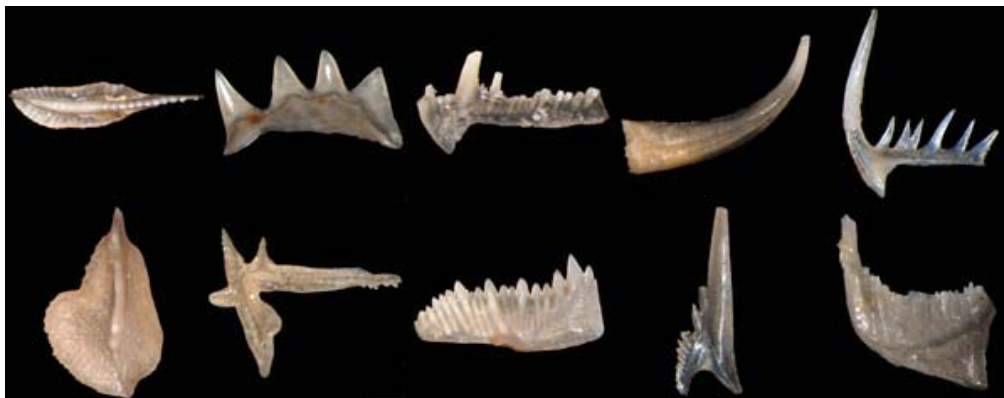
Selection of conodonts

possible cause is climatic cooling at low-latitudes, because the extinction was followed by the spread to tropical localities of high-latitude faunas. The key to supporting a climatic influence is temperature data from areas most affected by the extinctions. Unusually, a recent study selected phosphatic conodonts (tooth-like microfossils) for oxygen-isotope investigations - carbonate-shelled creatures are the usual choice. Michael Joachimski and Werner Buggisch, of the University of Erlangen in Germany, found prominent oxygen isotope excursions close the Frasnian-famenian boundary (Joachimski, M.M & Buggisch, W. 2002. Conodont apatite \delta^{18}\text{O} signatures indicate climatic cooling as a trigger of the Late Devonian mass extinction . Geology , v. 30 , p. 711-714; DOI: 10.1130/0091-7613(2002)030<0711:CAOSIC>2.0.CO;2). Their data are well controlled stratigraphically, because the rapid evolution of conodonts in the Devonian allows fine biostratigraphic division.