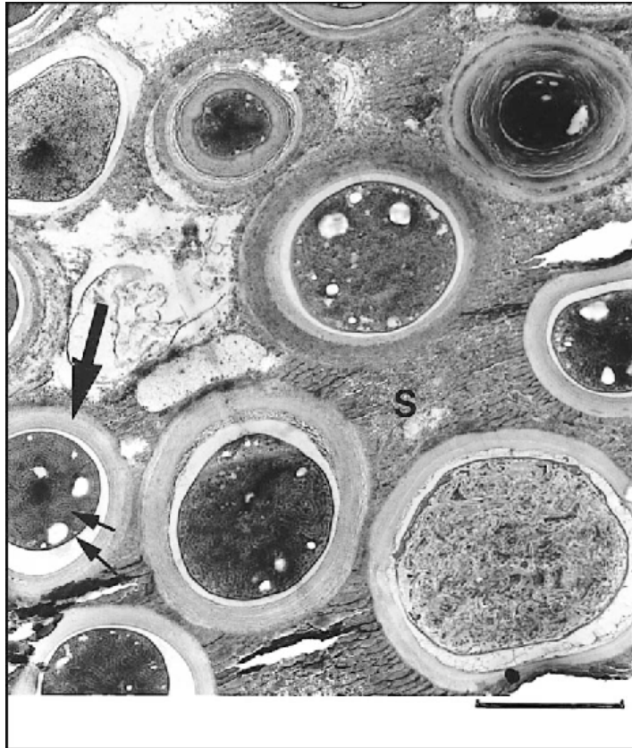
Electron microscope image of cyanobacteria cells sheathed in amorphous iron-bearing silica. (Credit: Phoenix et al. 2001; Fig. 1)