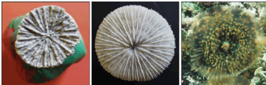
A Triassic fossil scleractinian coral (Left). The skeleton of a modern scleractinian (Middle). A living coral polyp (Right)

The rugose and tabulate corals were exclusively Palaeozoic colonial, carbonate-secreting organism. Their record ends abruptly with the end-Permian mass extinction. No examples of scleractinian corals have been found in rocks older than Triassic. The oddity is a 14 Ma gap in known coral fossils in the earliest Triassic. Scleractinians secrete calcium carbonate as aragonite, whereas rugose corals formed from calcite; an important difference in processes at the cellular level. It is hard to avoid the conclusion that the ancestors of scleractinians did not secrete carbonate and were entirely soft-bodied taxa during the Palaeozoic Era. If Permian Rugosa and Tabulata happily secreted carbonate, while proto-Scleractinia did not, there ought to be a biochemical or geochemical explanation for the last taking on a reef building role in Mesozoic times.