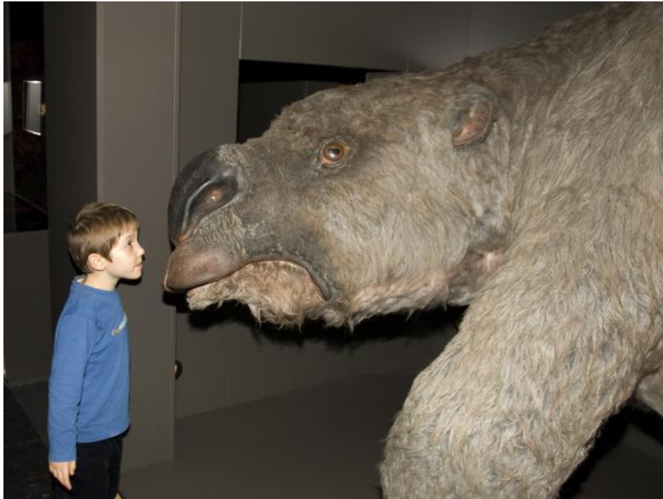
Reconstruction of the Late Pleistocene giant wombat Diprotodon which became extinct after modern humans colonised Australia.